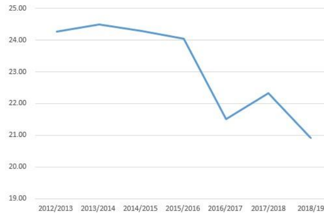
Figure 3: Milk Volumes (L) in the Murray Dairy Region