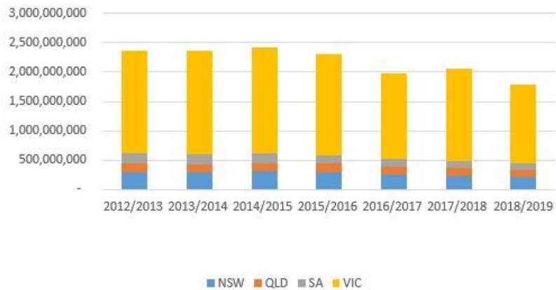
Figure 2: Milk Volumes (L) in the MDB by State