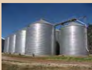
Option 1: Garry pays his supplier $1.30 per tonne per month to store his grain for him.

Garry's storage fee in the first month is 480 tonnes X $1.30, in the second month 440 tonnes X $1.30, in the third month 400 tonnes X $1.30 etc. Garry's total storage cost over 12 months is $4,056.