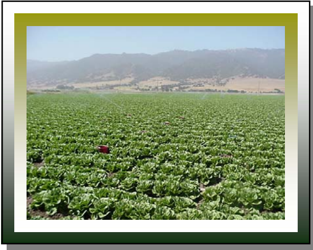
Sprinkler Irrigation with red catch can buckets strategically placed.