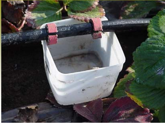
Catch can experiment in strawberry drip irrigated field.