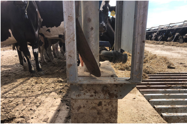
The cow alley is lower (15-20cm) than the rest of the feed pad. This is to allow for more effective flood washing. It was not certain how the cows would handle stepping down into the feeding area. The Gambles have experienced no issues with it.

The feed pad was finished and first used in December 2017.