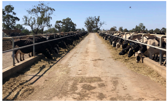
The Gambles' 122m long concrete feed pad looking from the south (low end) north. The dairy is 60m south of where this photo is taken from.

The costs to construct the feed pad were as follows: