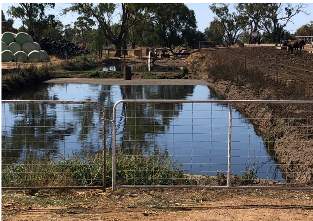
The 3ML effluent dam for the flood wash. The earth from digging this was used to build the base for the feed pad.

In 2017, the Gambles constructed a concrete feed pad with loafing areas on the sides close to the dairy. They were able to utilise a GMW Connections project to provide around 25 per cent of the earth and the rest came from digging an effluent pond alongside the feed pad for the flood wash system.