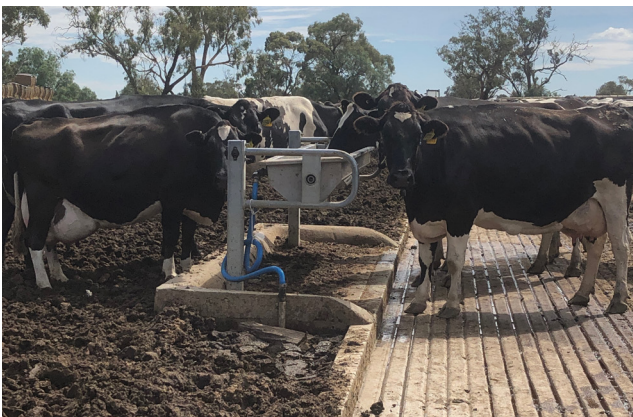
One of the water troughs that are placed on the edge of the cows' concrete feeding area and the loafing area. A solid back will be made behind the water troughs to stop cows from spilling water onto the dry manure.

The loafing area is scarified every second day to help it stay dry, break the bugs down faster and keep it soft. Ideally it should be scarified every day. A metal shield is about to be installed on the cow loafing side of the water troughs (the water troughs are installed on the edge of the concrete cow area) to stop the cows spilling water into the loafing area.