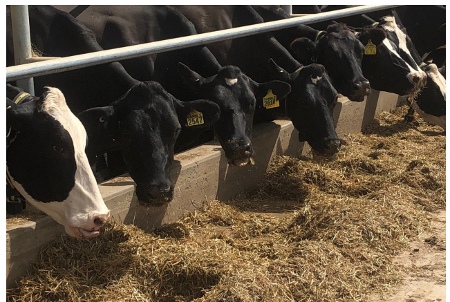
The cows have just started returning from afternoon milking to a fresh mix. The Gambles use a blade on the tractor to keep the feed within reach of the cows.

Cow comfort, less walking, better access to the feed for the whole herd and better cow cooling (allowing them to eat for a greater length of time each day) are also likely contributing factors to the increase in milk production.