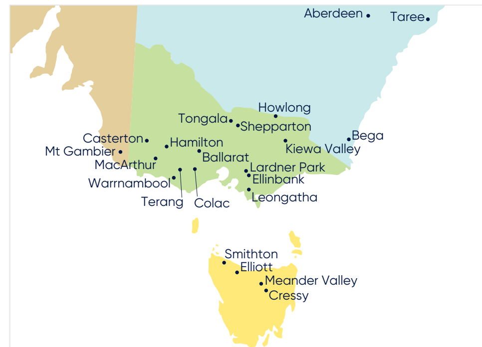
Figure 1 Map of trial locations across south eastern Australia that contributed to the FVI in 2023