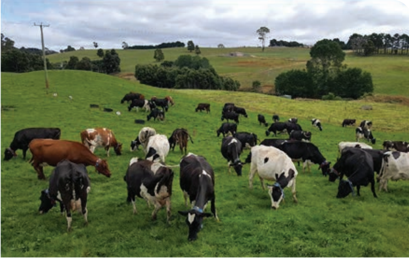
Cows grazing at Elliot Dairy Research Centre in Tasmania