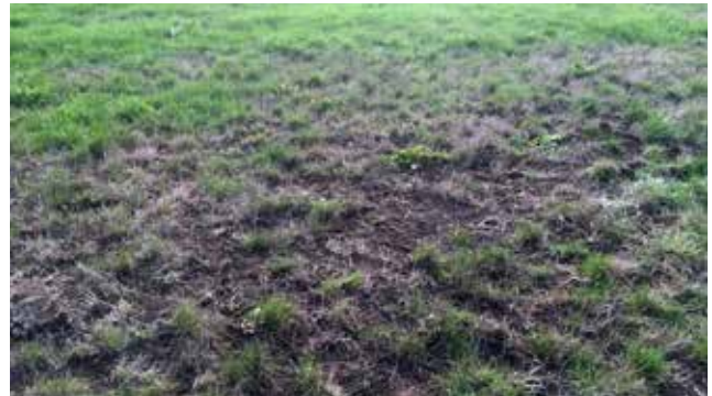
African black beetle pasture damage.

There are multiple yellowheaded cockchafer species and while their life cycles are largely unknown, they are thought to reach the most damaging third instar larval stage during winter.