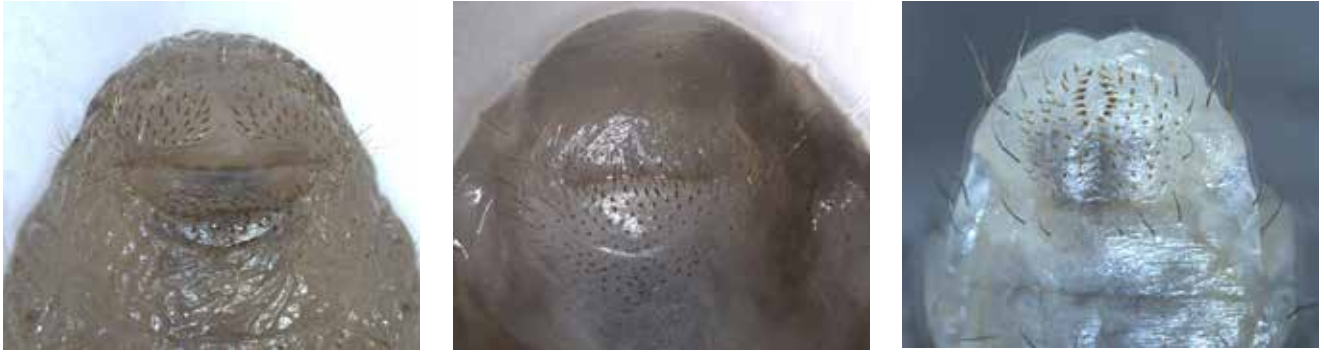
ABB, redheaded pasture cockchafer and blackheaded pasture cockchafer anal openings, respectively.