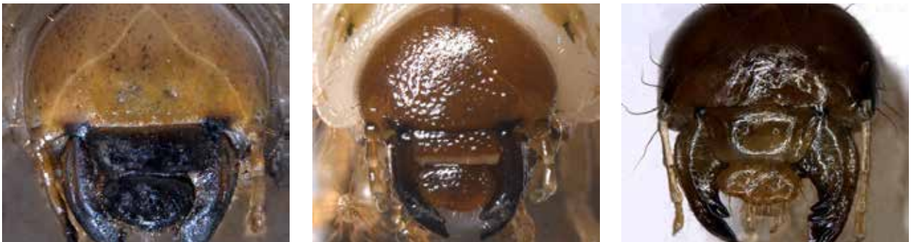
ABB, redheaded pasture cockchafer and blackheaded pasture cockchafer head capsules, respectively.