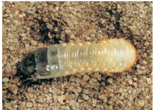
African black beetle larva.

ABB larvae have six legs, a brown head capsule, and a 'C-shaped' body. The larval body is grey in appearance when young but transitions to creamy-white when mature. They are ~5 mm when they hatch, growing to ~25 mm in length. The larvae damage pastures by pruning or completely severing grass roots close to the crown of the plant. In severe cases where infestation occurs, pastures become patchy and can be rolled back like a carpet.