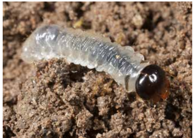
Blackheaded pasture cockchafer larva.

The adult beetle form of ABB is 12–14 mm long, has a brown to black body with indented longitudinal striations on the wing covers, and flares and spurs on its legs. Adult beetles have strong nocturnal flight activity, and disperse during their 'roaming' stage primarily in autumn, leading to paddocks becoming infested. The adults feed on the stems of a variety of young plants either underground or above the soil surface, often killing growing points so that the central shoots wither and the plant dies.