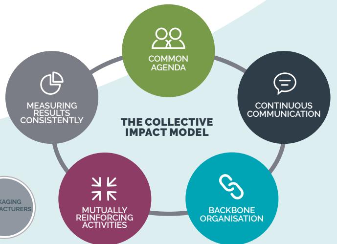
Figure 1: Collective impact framework

Acknowledging the diversity of organisations that comprise the packaging value chain (see Figure 2), APCO's Collective Impact approach seeks to bring together that diversity to consolidate efforts and maximise opportunity to deliver packaging sustainability and meet the 2025 Targets.